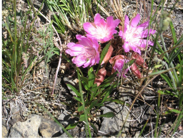
Bitterroot, courtesy of Beynon's