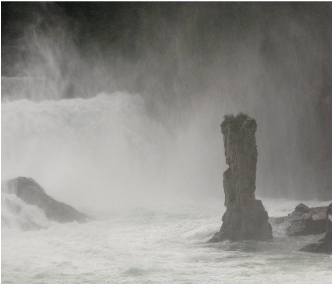
"Coyote Rock" and Lower Bonnington Falls

1054 Bridgeview Cr, Castlegar BC V1N 4L1 vol 37, no 3 November 2010 – February, 2011