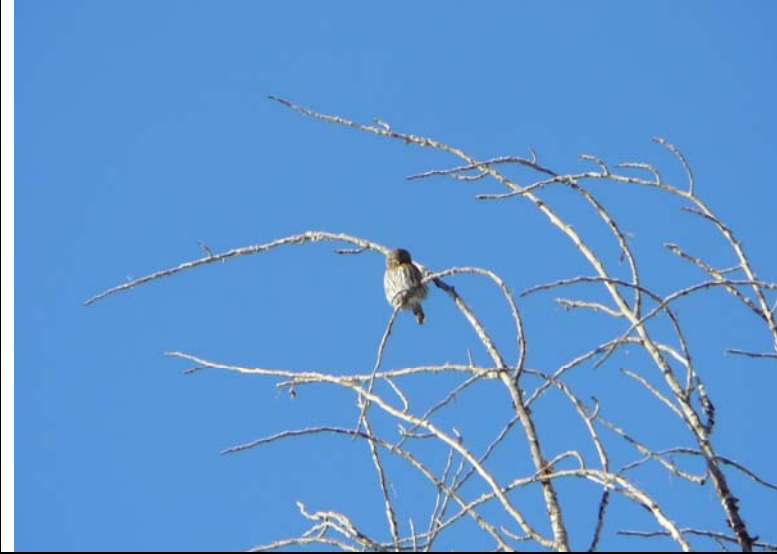
.Cranbrook Christmas Bird Count Highlights